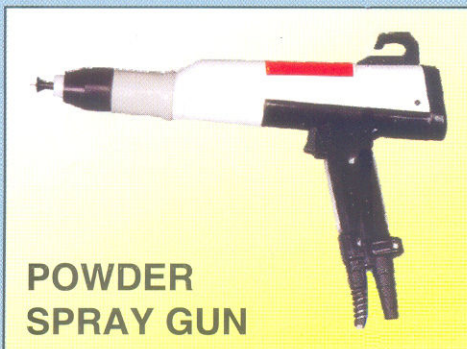
POWDER SPRAY GUN